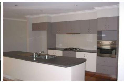
6 Luke Place SPRING GULLY VIC

Very Modern BV 3 bedroom home. Bedrooms with BIR's, shower and bath, and separate toilet. Ducted gas heating & evaporative cooling, open plan kitchen/meals area with polished floor boards and gas/electric appliances. Low maintenance garden, enclosed backyard with a paved entertaining area. Double lock up carport. Great location in a nice area.